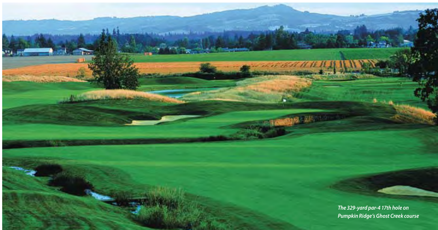
The 329-yard par-4 17th hole on Pumpkin Ridge's Ghost Creek course

BUILT TO HOST MAJOR EVENTS, PUMPKIN RIDGE GOLF CLUB SET ITS SIGHTS HIGH FROM THE BEGINNING, and remains one of the purest golf experiences in the Pacific Northwest.